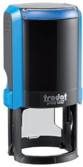
Round stamp imprint - not actual size.

For More Notary Products & Options Visit Our Website at www.NotaryPublicUnderwriters.com